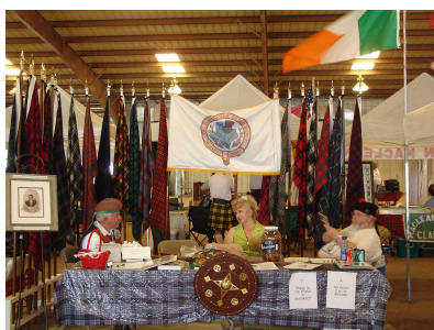
Manning the H&T booth at the Houston Highland Games.