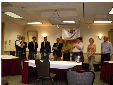
H&T Officers presenting checks to winning Pipers at the open piping competition.