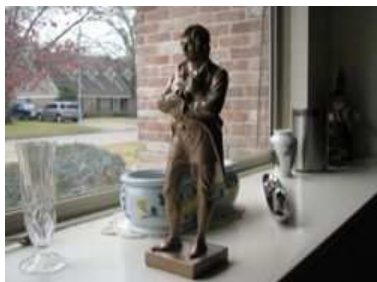
New Burns Statuette